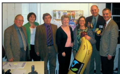
A fair price for producers Members of the Fairtrade group are delighted with their success

A directory of all local stockists will be used to promote items produced all over the world, including our own local producers such as farmers. Wymondham has a very successful farmers market and it is equally important that we promote fair prices for their products.