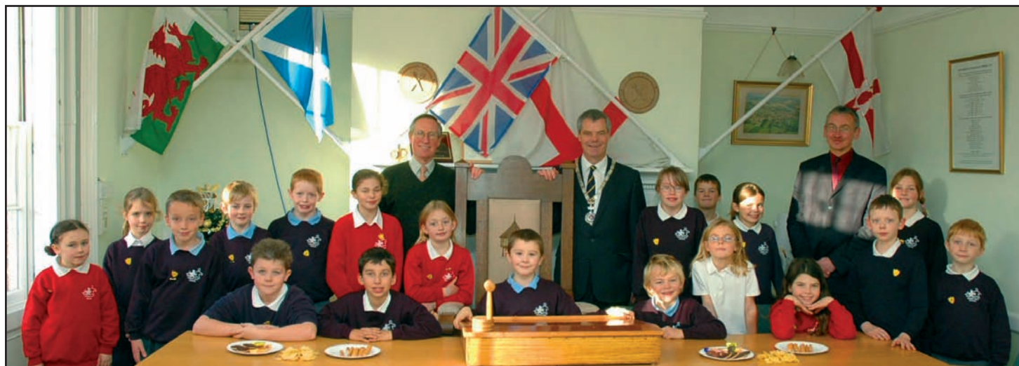
Town Councillors of the future? Pupils from Robert Kett School had tea with the Mayor in December. A tradition of annual visits from the school has been established.

All meetings are usually held at 7.30pm and agendas are advertised on the Town Council notice board and the council website. Time is set aside for public participation at all our meetings.