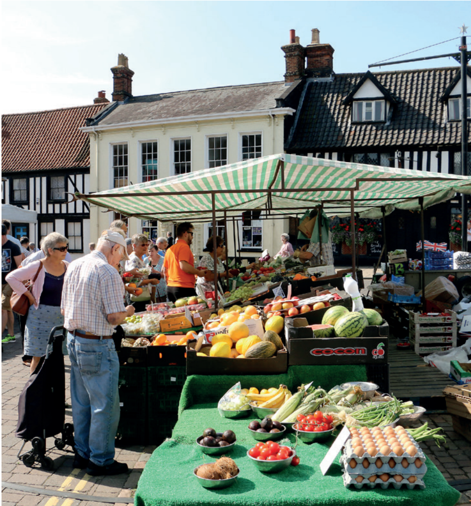
See you at the market: Wymondham's markets offer good value for money, as well as a meeting place for friends and neighbours

Regular users of Wymondham's markets will have noticed a slow decline in the level of market place shopping. There is a reduction in the number of market traders – people's shopping habits are changing as cheap retail outlets increasingly meet their needs.