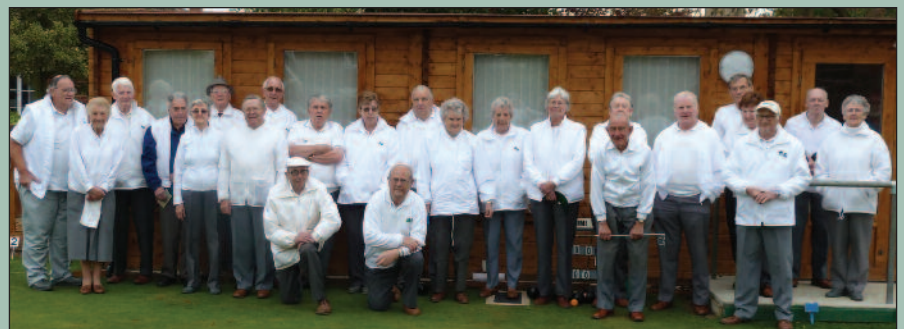
Everyone's a winner Members line up to show off their new clubhouse and equipment store.