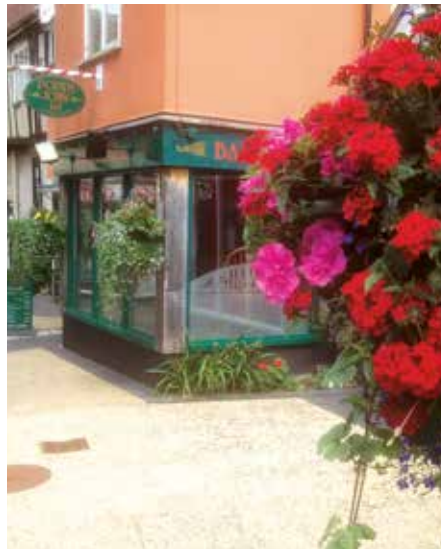
Complementing our fine streets: Floral displays of all kinds throughout the town add colour and interest over the summer months.

Judging will be split between a judging panel and shopkeepers themselves. Voting slips will be delivered to all town centre businesses in early July. Completed voting slips can be handed in at Mad Hatter's Tea Shop or at Wymondham Garden Centre.